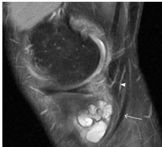
Figure 1: Pes anserine bursitis. Sagittal proton density fat-saturated image of the medial aspect of the left knee in a 47-year-old male floor layer. Arrow, semitendinosus tendon; arrowhead, semimembranosus tendon.

Knee joint effusion was registered (0 = none, 1 = present) as the presence of a localized fluid collection in the intercondylar area, in the medial or lateral recess, or as a generalized fluid collection that distended the suprapatellar recess. Abnormalities in the MR signal intensities predicting meniscal tears were classified in grades 1–3 and radiographic knee OA were classified using a modified Ahlbäck scale of joint space narrowing (JSN).