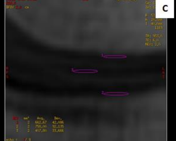
(Figures 2 A-C)