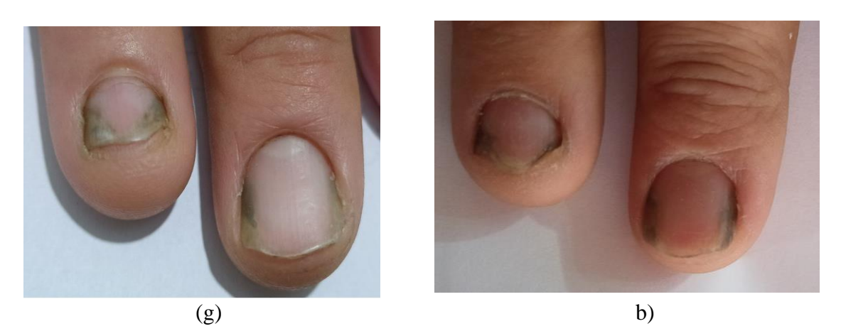
Fig. 2: (a) 35-year-old female patient with onychomycosis before treatment. (b) After treatment with long-pulsed Nd:YAG 1,064 nm, with good improvement 65%.