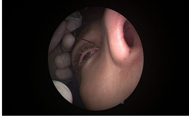
Fig. 1: placement of a Bowman lacrimal probe into the lacrimal sac through punctum.